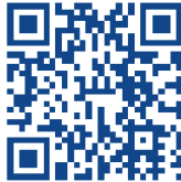
"The Smartest Giant in Town Story"

We have loved reading and working on our story "The Smartest Giant in Town" in Navy Class this term. We have sequenced the story ourselves from images and matched the clothing to the needs of the animals. We have dressed in sequence for SPHE, and sorted clothing for different weather conditions during Maths. HWT is in full swing and we are all enjoying our writing lessons.